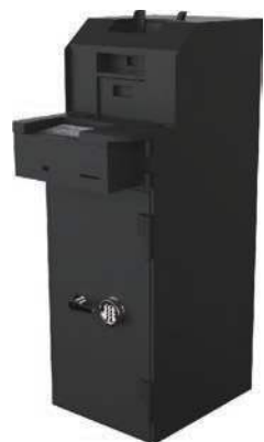
KUAN Lite with Cover